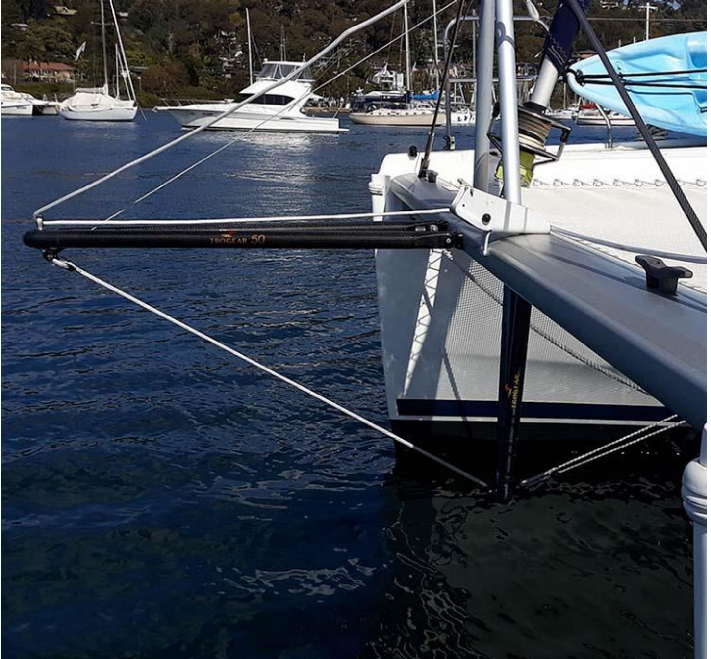
Leopard 44 with Dolphin Striker

You can also install using a second, shorter sprit as a dolphin striker. With this set up, you do not need whiskers. The benefit of this system is to avoid any conflict with whiskers when deploying an anchor. Additionally, the bobstay in this solution works better due to a better pulling angle and less flexing compared to bridle/whiskers.